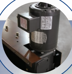
Long Life Extra Heavy Duty Motors