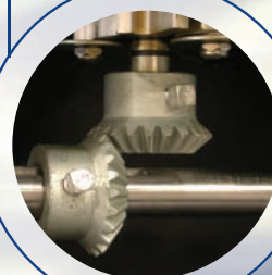
All Solid Steel Gears and Components