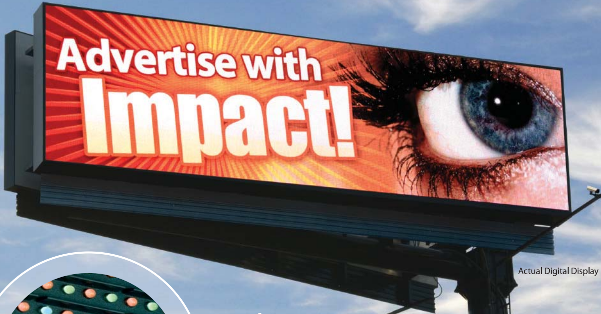
Actual Digital Display Image